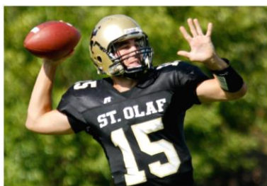
The inside of a football is made of Butyl Rubber.

Butyl Rubber is synthetic. This means it is only made by people. Synthetic materials begin with natural resources. The natural resource that Butyl rubber is made of is oil. The oil is drilled from underneath the ground in many places around the world.