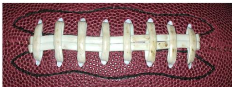
Football laces help to grip the ball.