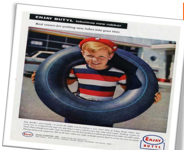
Butyl rubber advertisement

SYNTHETIC MEANS MADE BY MAN, BUT NATURAL MEANS COMING FROM NATURE