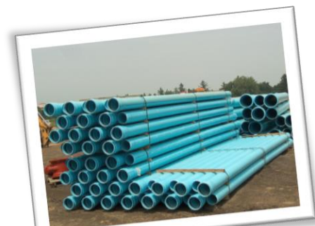
The same material that is used to make pipes make up most laces.