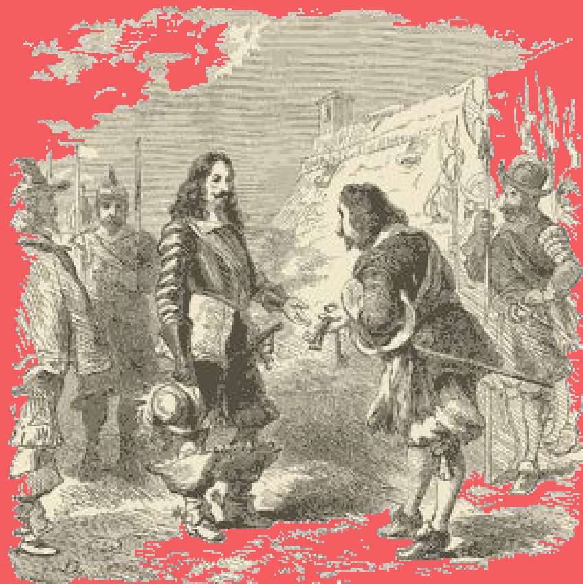
Dutch surrender to the English